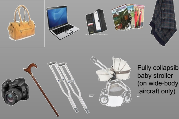
Fully collapsible baby stroller (on wide-body aircraft only)